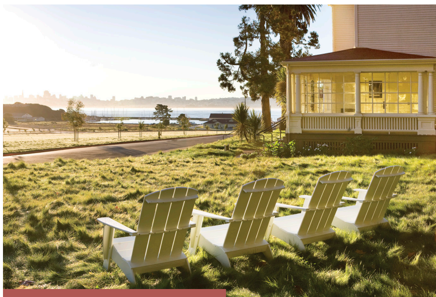
Cavallo Point Lodge offers 142 rooms and suites, mixing historic and contemporary accommodations across Fort Baker's 335 scenic acres.