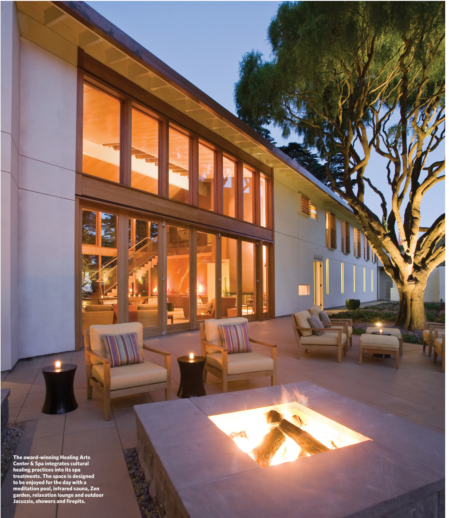
The award-winning Healing Arts Center & Spa integrates cultural healing practices into its spa treatments. The space is designed to be enjoyed for the day with a meditation pool, infrared sauna, Zen garden, relaxation lounge and outdoor Jacuzzis, showers and firepits.